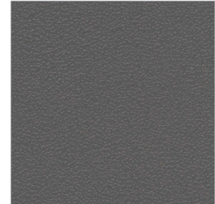
Charcoal Gray (S215)