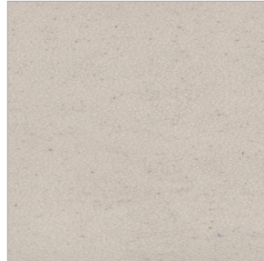
Desert Stone (S406)