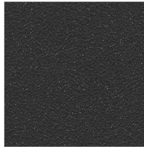
Starry Night (S225)